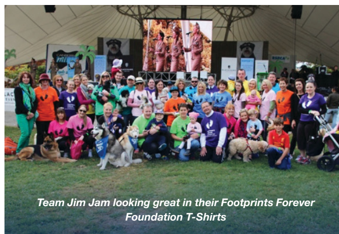
Team Jim Jam looking great in their Footprints Forever Foundation T-Shirts

Visit Footprints forever at - footprintsforeverfoundation.org.au