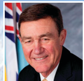
Air Chief Marshal Angus Houston AC, AFC (Ret'd) formerly Chief of the Defence Force from 2005 until 2011.