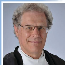
Justice Richard Refshauge , Judge - ACT Supreme Court.